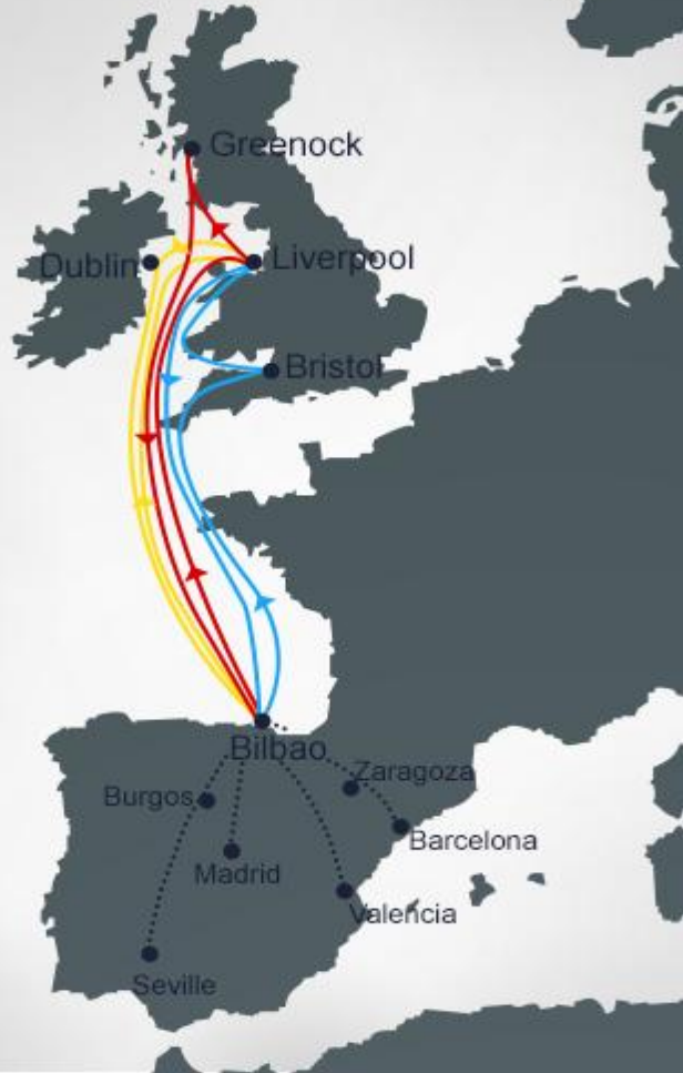
5 day transit door to door