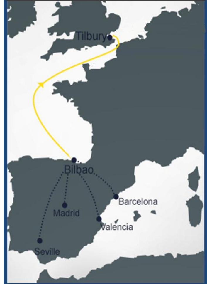
5 day transit door to door